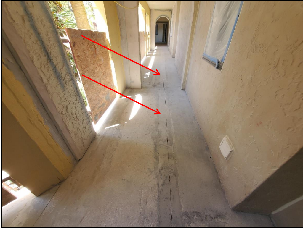
Photograph 8. 2 nd floor hollow core joint repairs completed.