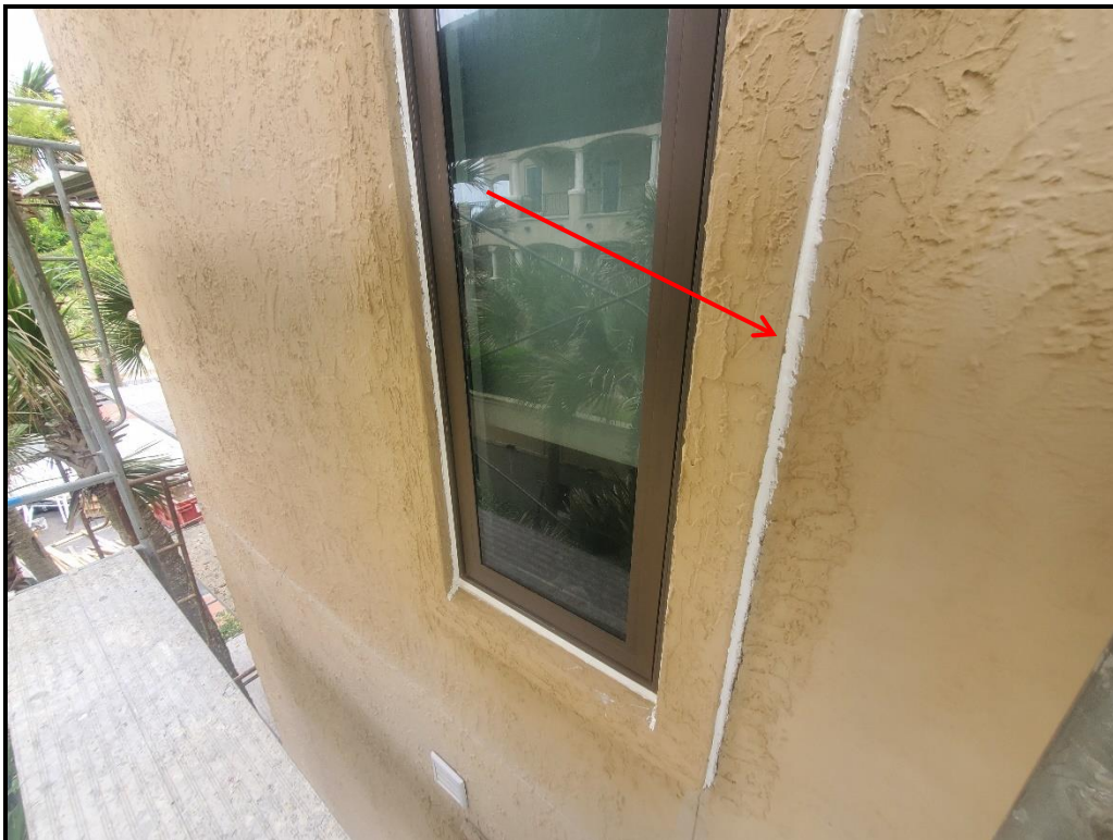
Photograph 15. South elevation sealant application in progress.