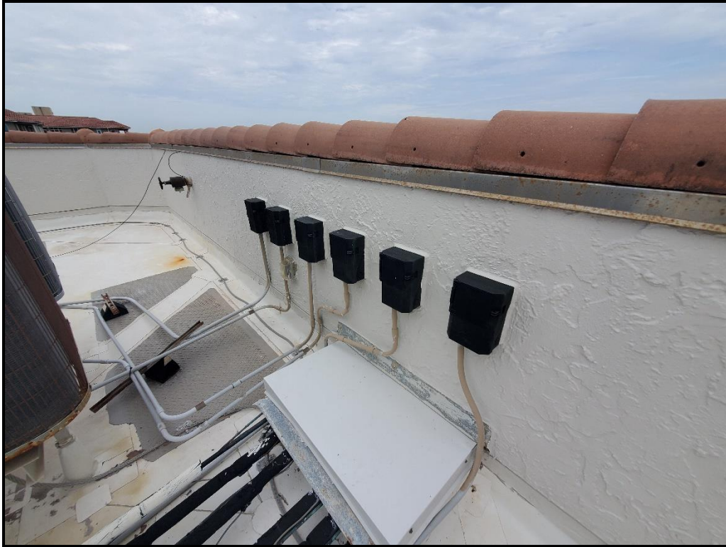
Photograph 18. Upper flat roof wall coating completed.