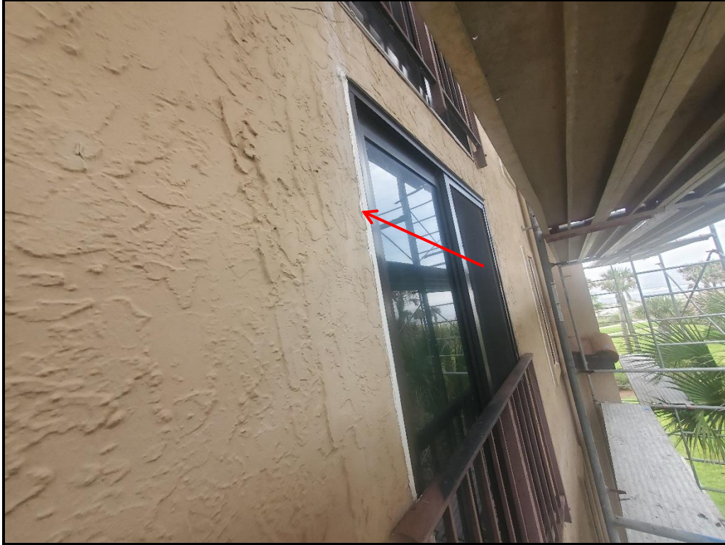
Photograph 16. South elevation sealant application in progress.