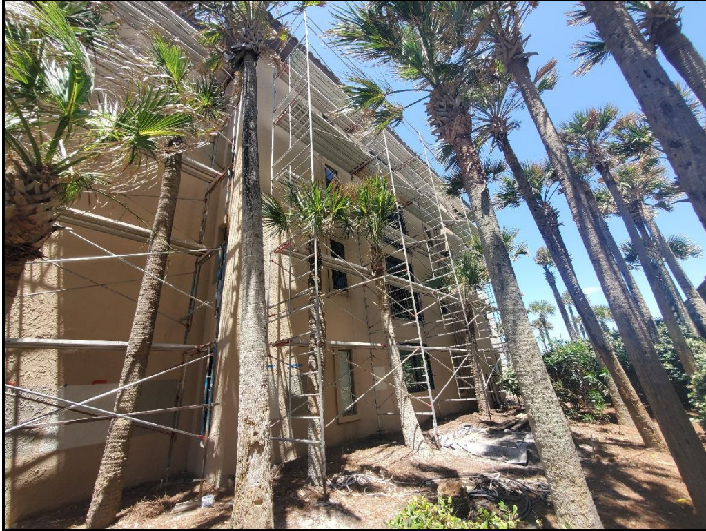
Photograph 10. South elevation, scaffolding installed for access.