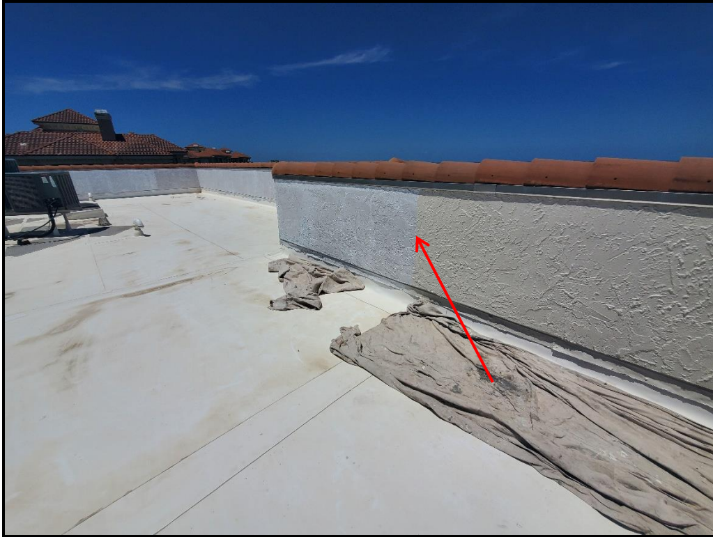
Photograph 2. Upper flat roof parapet wall coating in progress.