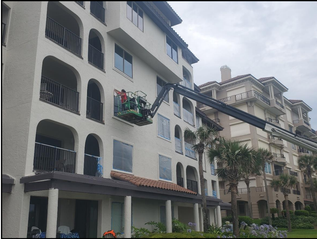
Photograph 12. Drop 4 wall coating completed, cleaning and plastic protection removal in progress.