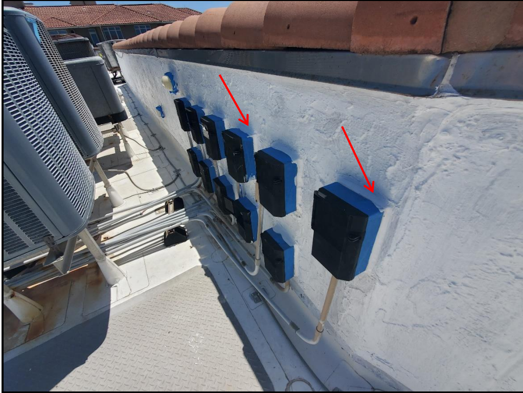
Photograph 4. New sealants installed on HVAC disconnect boxes.