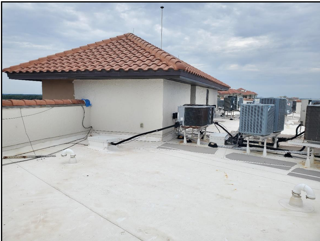
Photograph 17. Upper flat roof wall coating completed.