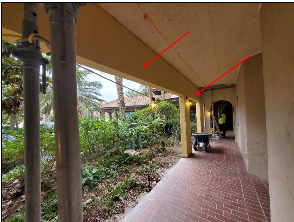
Photograph 13. 1 st floor archway weather barrier application in progress.