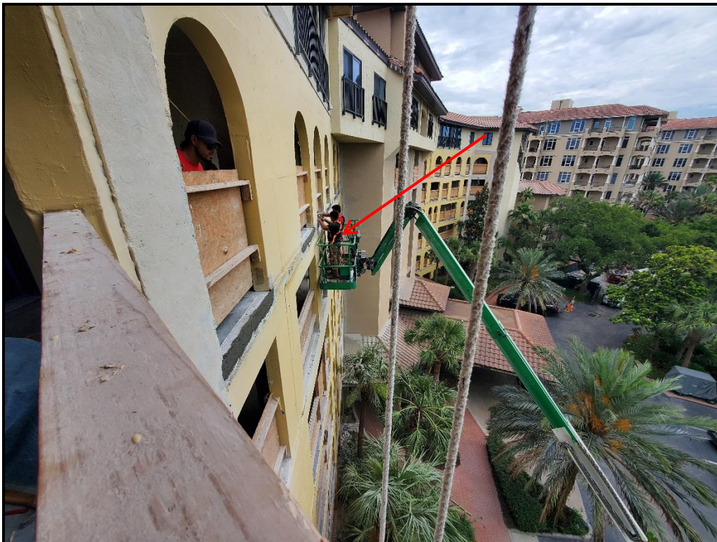
Photograph 19. West elevation stucco installation in progress at slab edges.