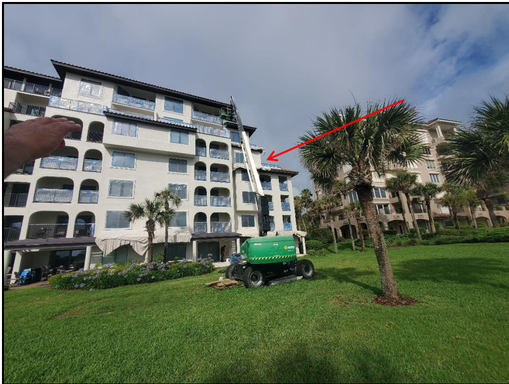
Photograph 1. Drop 5 wall coating in progress.