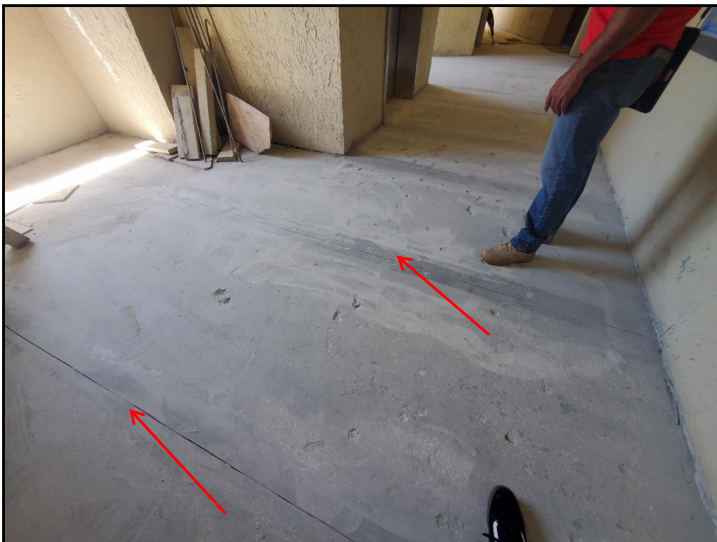
Photograph 9. 2 nd floor hollow core joint repairs completed.