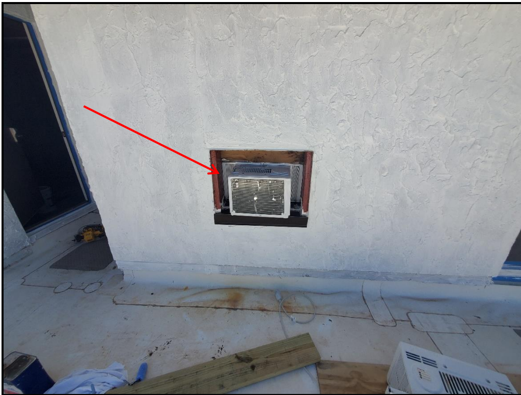
Photograph 5. Framing and flashing repairs in progress on elevator mechanical room HVAC opening.