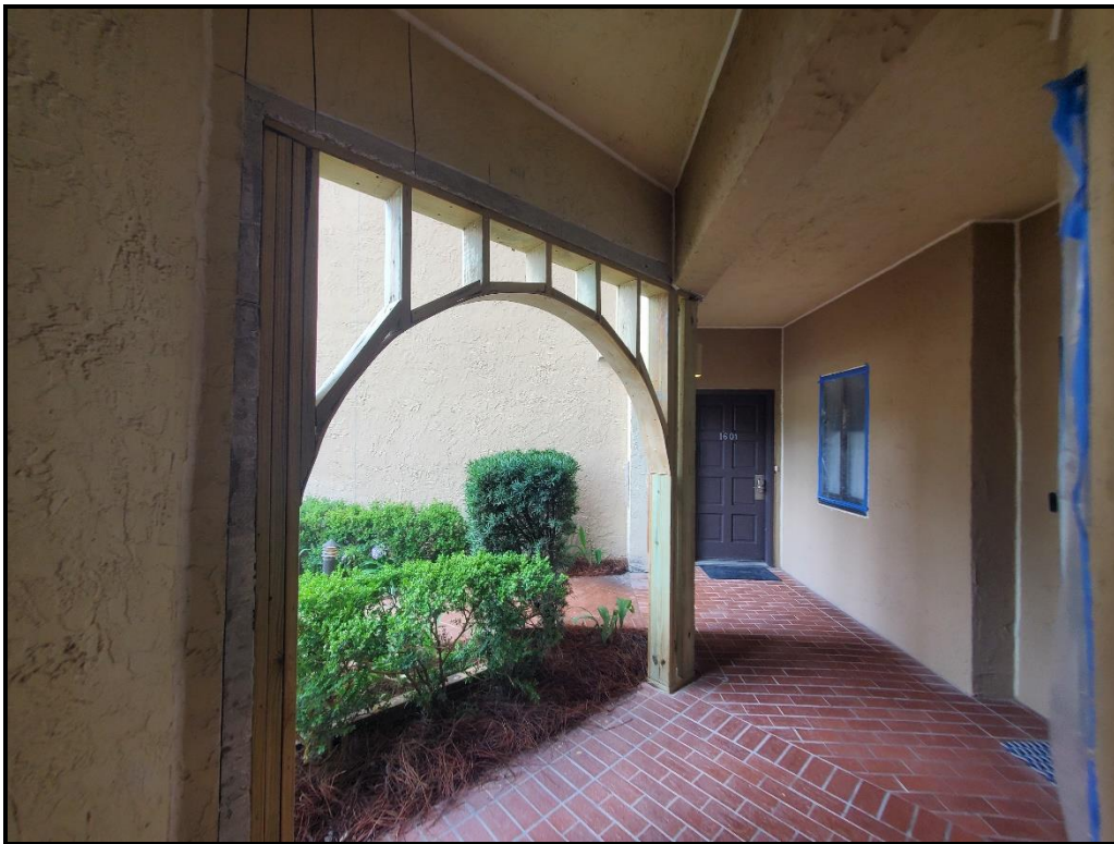
Photograph 7. 1 st floor archway rebuilds nearing completion.