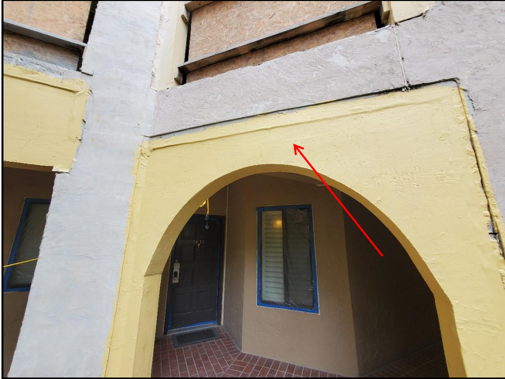
Photograph 14. 1 st floor archway weather barrier application in progress.