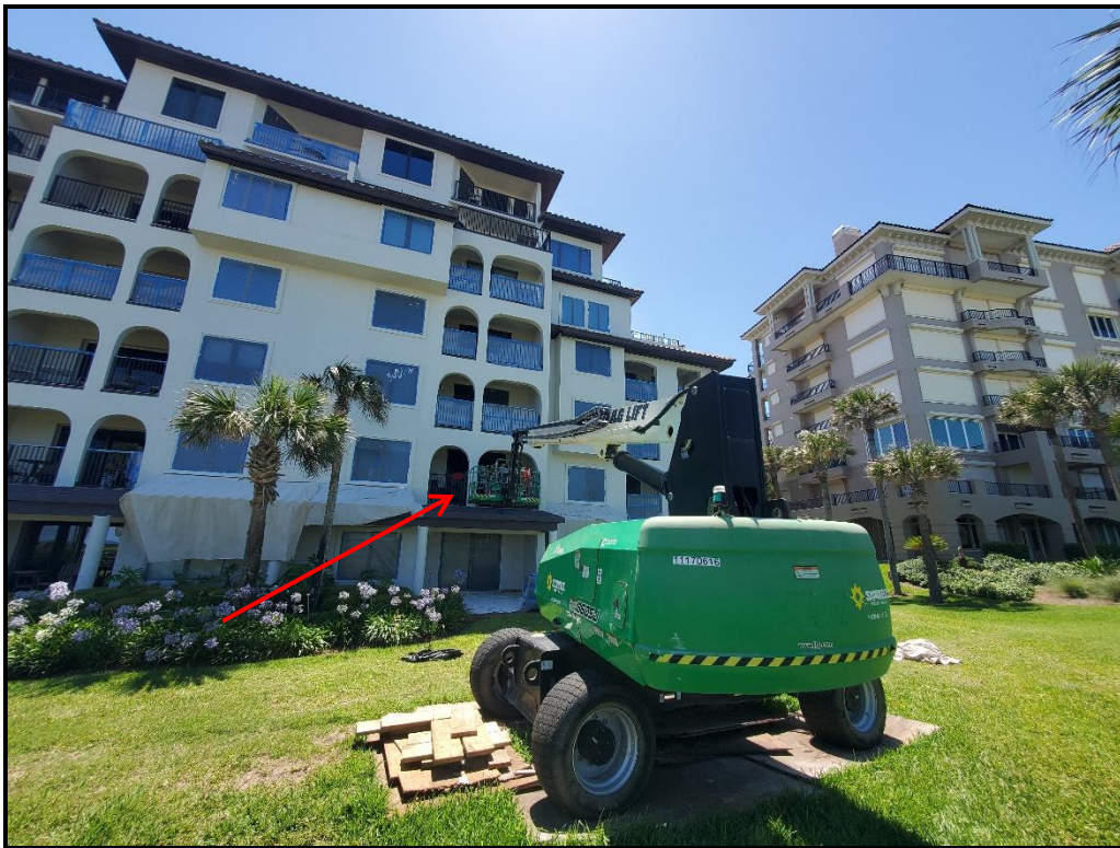
Photograph 11. Drop 5 wall coating completed, punch work in progress.