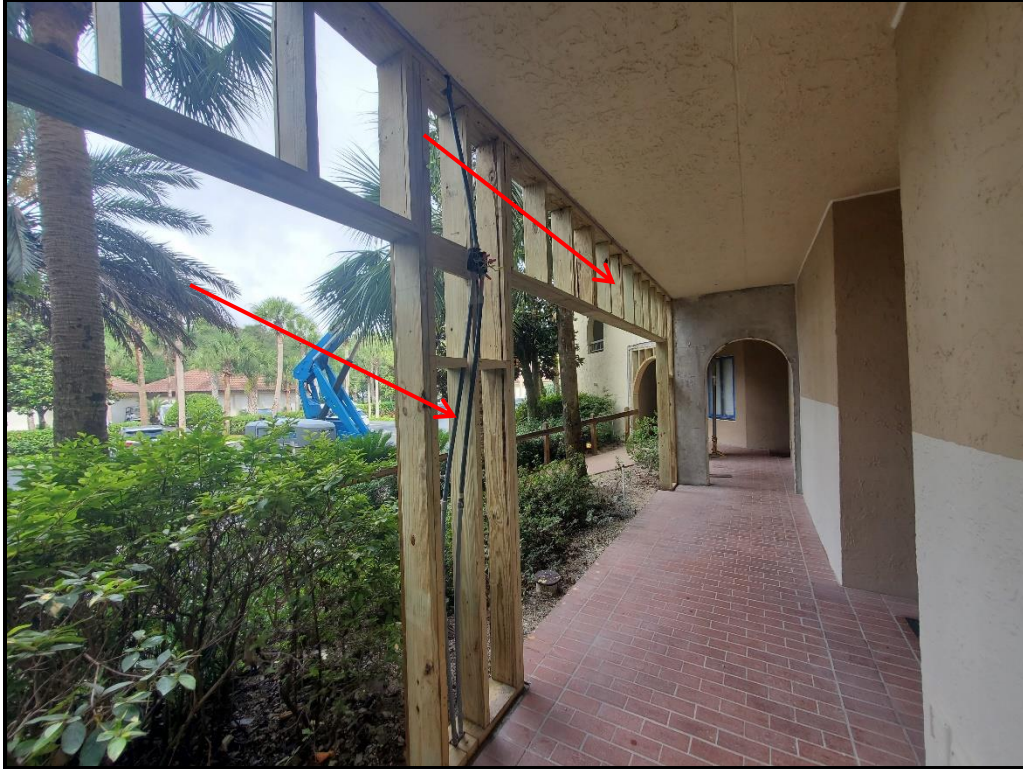
Photograph 6. 1 st floor archway rebuilds nearing completion.