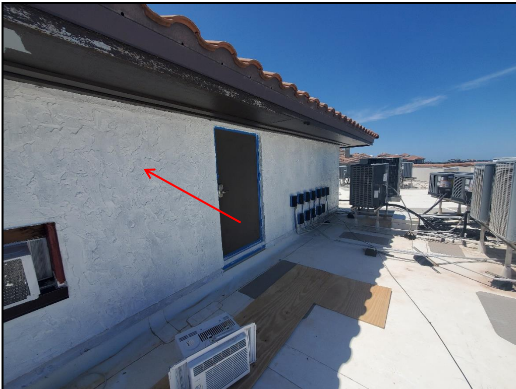
Photograph 3. Upper flat roof wall coating in progress.